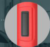
TF Card & Charging Port