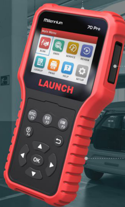
Portable & handheld